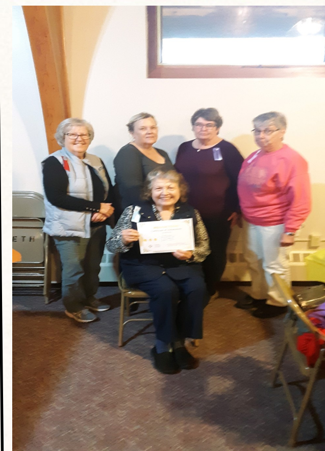
The United Methodist Women received recognition for their mission work at the October meeting from the Shepherdess.